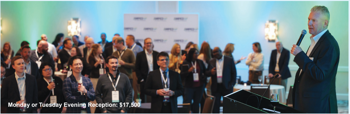
Monday or Tuesday Evening Reception: $17,500