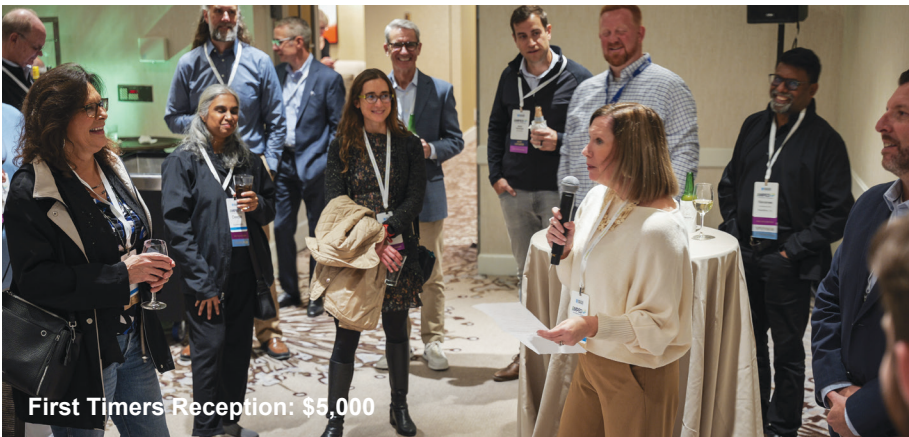
First Timers Reception: $5,000