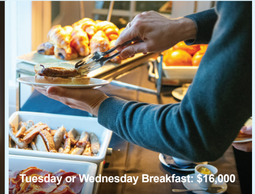
Tuesday or Wednesday Breakfast: $16,000