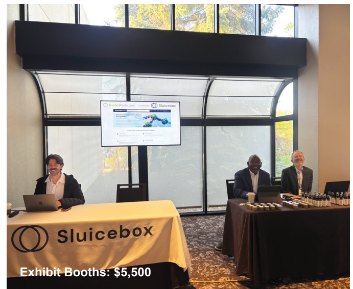
Exhibit Booths: $5,500

Website, App recognition, Sponsor Ribbon, Mention at Conference