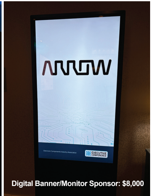
Digital Banner/Monitor Sponsor: $8,000